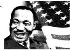
Martin Luther King Jr. Day

One last thought: I believe I may have commented on this subject before, Civility. I share with you today from the website “revivecivility.org,” thoughts on fostering civility on social media—tips to stay respectful on social media. 1) Check for accuracy—before sharing information, check the accuracy of the story, and if all sides of the facts are portrayed or available. 2) Insults and name calling—separate people’s opinions from who they are as a person. Before you post, consider whether your story/comment contributes to civility. 3) Seek information from different perspectives—is it a 9 or a 6? 4) Walk away—step away, pause, and take time to think if there is room for a civil response. 5) Spread respect—share information about the role of civility and respect in promoting constructive conversations.